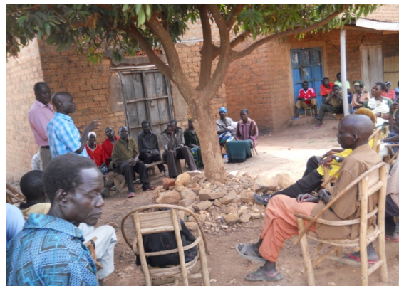
Figure 1: Community Mobilization in Jungi Village, Koboko District

Pilot HC-II controls will be enrolled at three villages that are near rivers, swamps, or lakes (“wet villages”) starting at the end of June. This phase will take about three weeks, depending on attendance at HCII units.