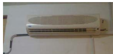
Figure 2: AC Unit in the EMBLEM Laboratory