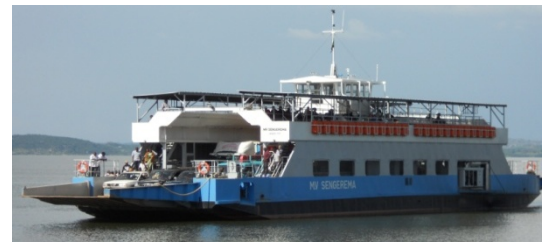
Ferry crossing Lake Victoria en route to Sengerema