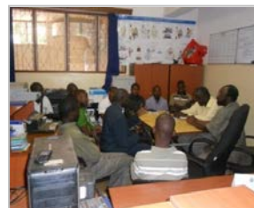
PI with some Tanzania and Uganda EMBLEM Staff