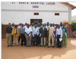
PI and Trainees