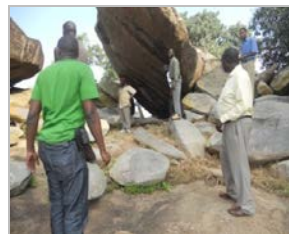
EMBLEM Team on a Tour mission to Sr. Samuel Baker Fort. L to R: Team moving to the Fort. Existing structures at the Fort. Naturally curved stones.

EMBLEM Newsletter is a monthly on-line publication based on contributions of the EMBLEM Study staff.