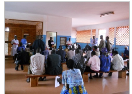
BL Tutorial in Outpatient Department

Lacor hospital has launched radio messages about cancer and BL in order to disseminate information to the entire region.