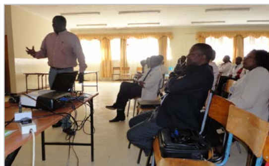
Grand Rounds at Moi University School of Medicine