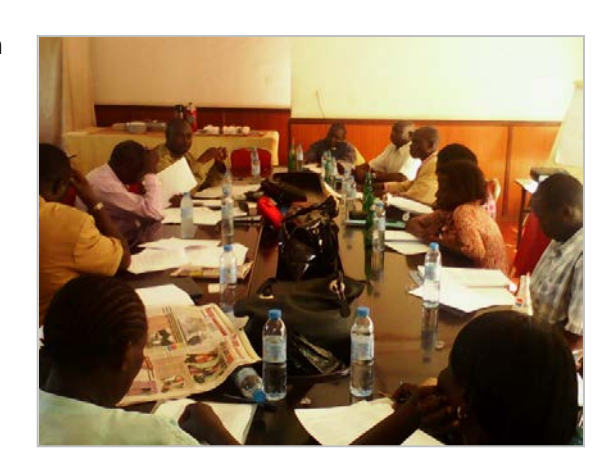
Members of the CAB in a meeting

One strategy to improve community response and increase awareness about the study is to provide regular updates to the Community Advisory Board (CAB). The EMBLEM team met 20