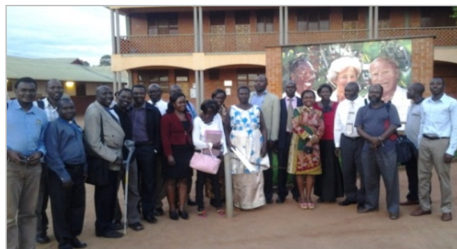
Uganda Community Advisory Board