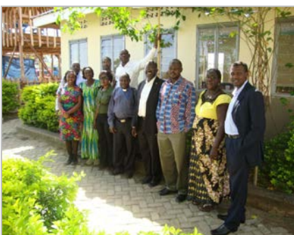
Members of the EMBLEM Northwest Community Advisory Board and EMBLEM PIs at a meeting in Nebbi

By end of April, 330 potential cases (117 females and 213 males) were spotted and screened and 159 were enrolled (59 females and 100 males). Control enrollment was completed in Kirombe Village - the 10 th of 12 pilot villages.