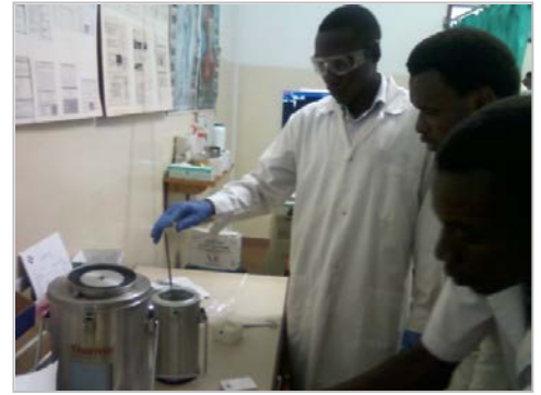
EMBLEM Staff complete testing SOPs for collecting fresh-frozen tumor samples