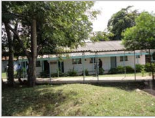
EMBLEM Kenya building at Homabay