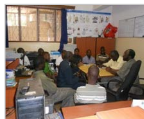
PI with some Tanzania and Uganda EMBLEM Staff