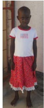
A successfully treated BL patient at the EMBLEM study center in Shirati

An EMBLEM Study data manager and 3 lab technicians underwent training at Lacor Hospital in Gulu, Uganda, hosted by AFENET and EMBLEM Uganda. Meanwhile, renovations were carried out on the buildings which will house the EMBLEM study center in Shirati. At Bugando Medical Center in Mwanza, registration and enrollment of cases for the INCTR treatment trials for BL are underway and the final lab and office setup plans are being completed for EMBLEM.