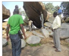
EMBLEM Team on a Tour mission to Sr. Samuel Baker Fort. L to R: Team moving to the Fort. Existing structures at the Fort. Naturally curved stones.

EMBLEM Newsletter is a monthly on-line publication based on contributions of the EMBLEM Study staff.