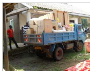
Loading Lab Equipment and Supplies for Kuluva